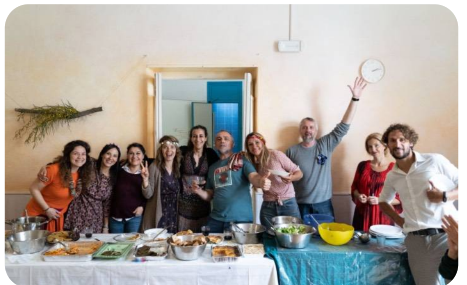
Kitchen Crew at the Spring Fair 2023

Our school is visited not only by the students during the first part of the day, but also by parents, members, by alumni and friends. It opens its doors to the city with festive events, cultural and social initiatives. The cultural calendar includes meetings, lectures, courses and workshops for children, youth and adults and artistic events. Moreover, the school is home to the Teacher Training Course for Steiner-Waldorf Teachers. In other words, our school is always teeming with life!