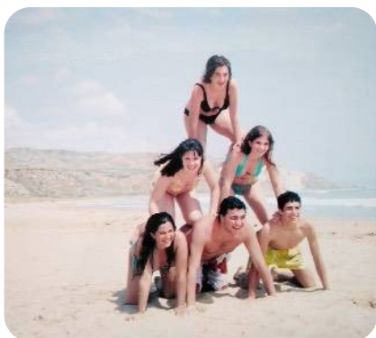
Eight grade in 2006