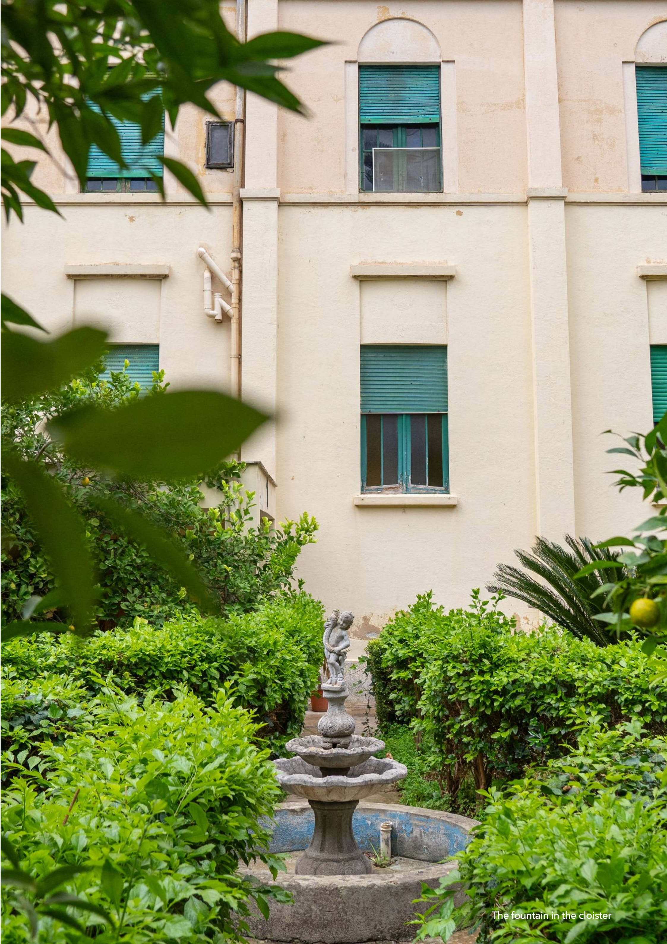
The fountain in the cloister