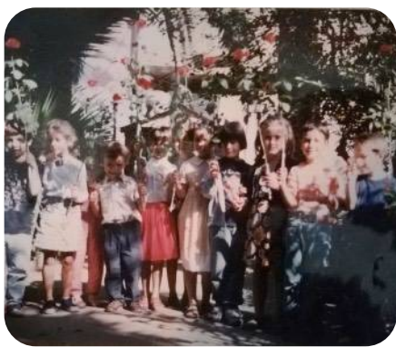
First grade 1996