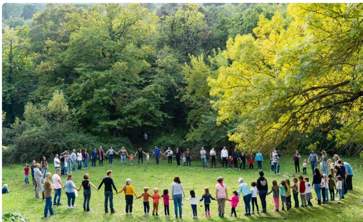
Autumn Outing 2022, Kindergarten Circle

The association's decisions are elaborated in collaboration and mutual trust by its members. The members share the educational ideals and support the teachers with their trust, weaving the fabric of the social life and participating in the school life which is formed by the following organs: The College of Teachers, the Board of Directors, the Parents. The organs of the school operate inspired by the principles of the three-fold social order suggested by Rudolf Steiner.