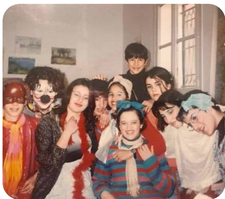
The first graduating 8th grade of the Libera Scuola Waldorf di Palermo, 1999

The Libera Scuola Waldorf di Palermo is member of the Federation of Steiner-Waldorf schools in Italy, belongs to the ECSWE (European Council for Steiner Waldorf Education) and to the network of parents of the Steiner-Waldorf movement in Italy.