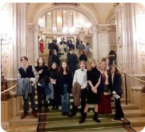
Eight Grade 2023