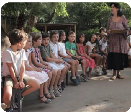
First grade 2022

By taking the changing needs that arise out of the physical and emotional phases of the growing child into consideration, Rudolf Steiner's educational approach strives to support the harmonious development of the three soul forces thinking, feeling, and willing.